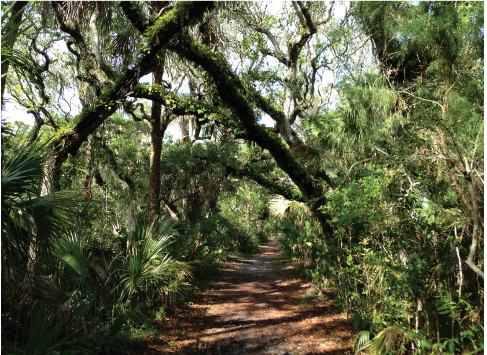
Castle Windy trail at Canaveral National Seashore