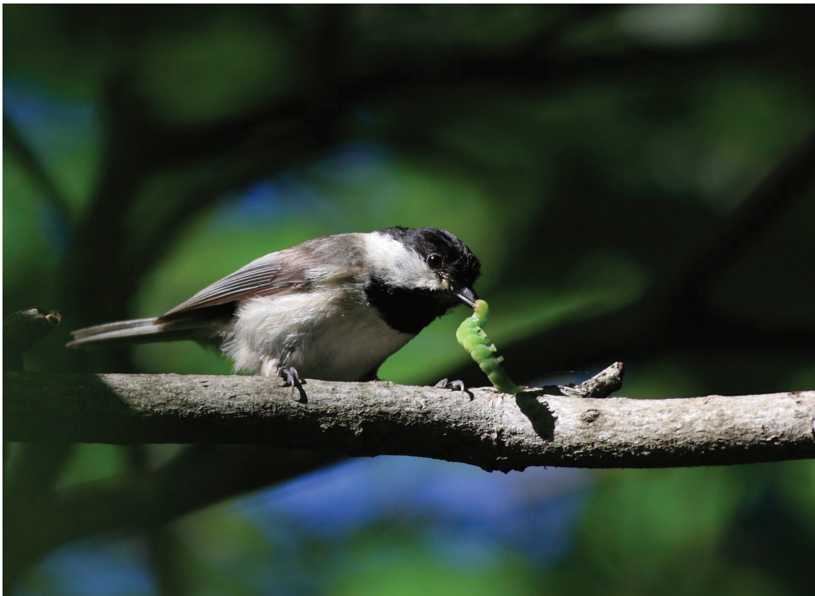
Chickadee eating a caterpillar.